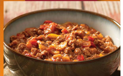
Jalapeno Beef Chili (Without Beans)