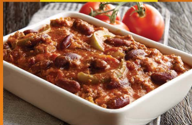
Beef Chili (With Beans)