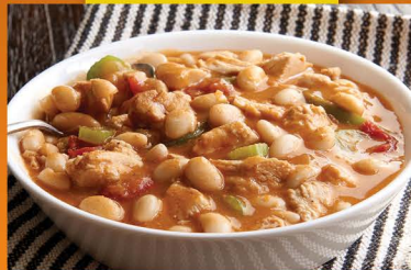
Chicken Chili (With Beans)